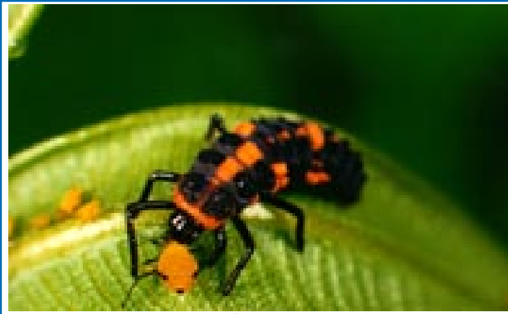
Figure 11 - Ladybug larva ( Cycloneda polita ) eating an aphid.

Many human beings have a deep appreciation of natural ecosystems. That is apparent in the art, religions, and traditions of diverse cultures, as well as in