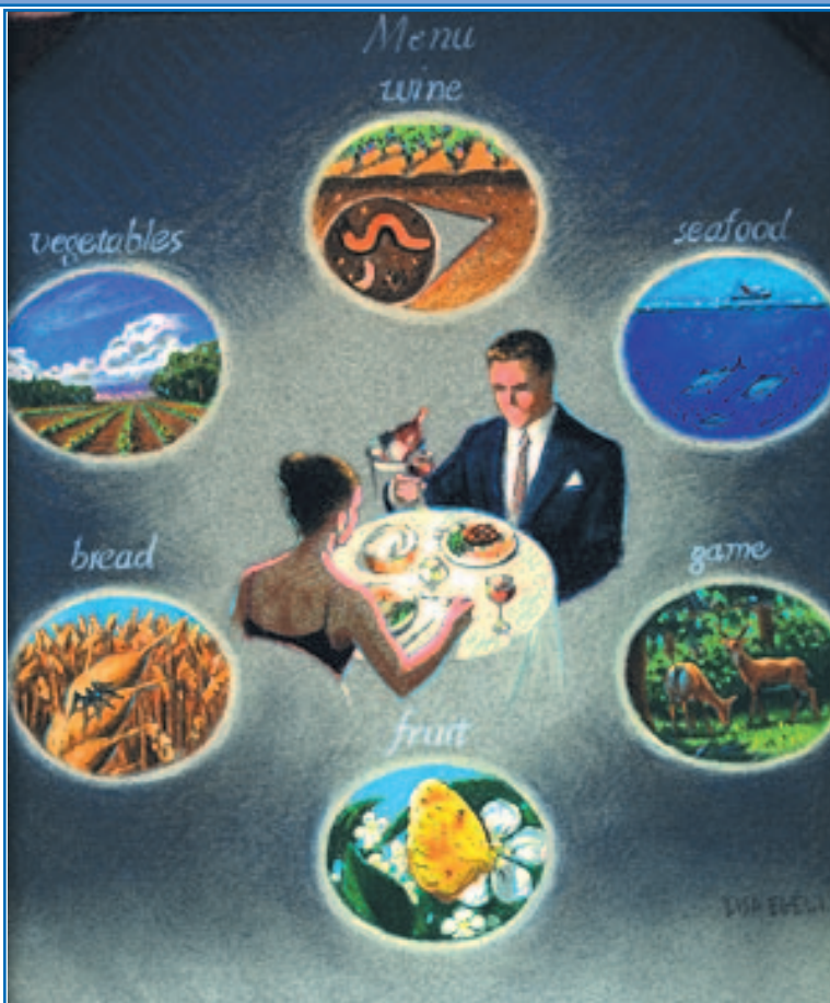
Figure 13 —The production of this meal benefited from many ecosystem services, including natural pest control, pollination, maintenance of soil fertility, purification of water, and moderation of climate.

operation of this model earth, it proved impossible to supply the material and physical needs of the eight Biospherians for the intended 2 years. Many unpleasant and unexpected problems arose, including a drop in atmospheric oxygen concentration to 14% (the level normally found at an elevation of 17,500 feet), high spikes in carbon dioxide concentrations, nitrous oxide concentrations high enough to impair the brain, an extremely high level of extinctions (including 19 of 25 vertebrate species and all pollinators brought into the enclosure, which would have ensured the eventual extinction of most of the plant species as well), overgrowth of aggressive vines and algal mats, and population explosions of crazy ants, cockroaches, and katydids. Even heroic personal efforts on the part of the Biospherians did not suffice to make the system viable and sustainable for either humans or many nonhuman species (Cohen and Tilman 1996).