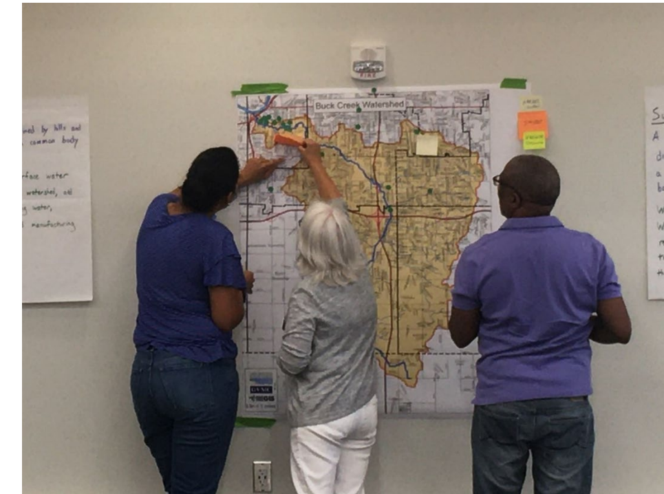
Workshop in Buck Creek community (Climate Resilience Consulting).

In Summer 2022 and Spring 2023, EPA contractors and EPA Office of Research and Development (ORD) piloted ERB in three EPA Regions: 5, 4, and 2. Lessons learned from the pilots were used to refine ERB content before wider public release of the tool.