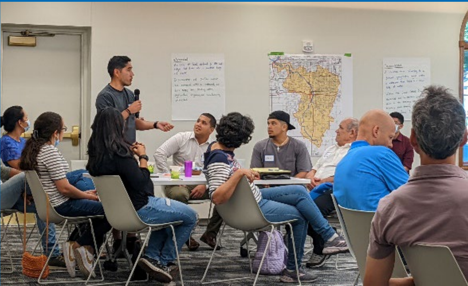
Buck Creek workshop (Climate Resilience Consulting).