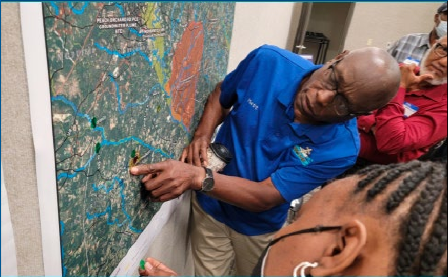
Mapping activity at the Waynesboro workshop.