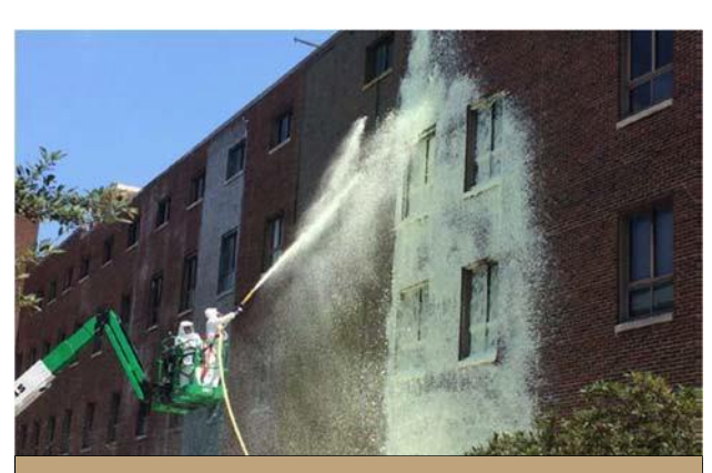
Demonstration of wash down methods for radiologically contaminated buildings Columbus, Ohio 2015

Legislation, presidential policy directives, and federal response plans give EPA specific responsibilities associated with disaster response, which includes being prepared to address wide area contamination, maintaining environmental laboratory capacity to analyze the large number of samples expected from a major incident, and protecting the Nation's drinking water systems.