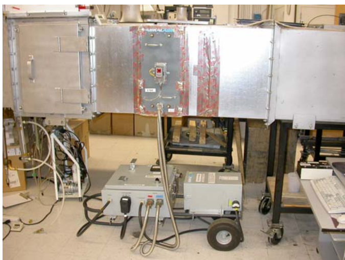
Figure 2-1. The device (left) and filter (right) are held in place with tape. Power supply is on the floor.

Table 2-1 provides information on the system as supplied by the vendor. Figures 2-1 and 2-2 provide views of the device as tested, installed in accordance with the manufacturer's specifications.