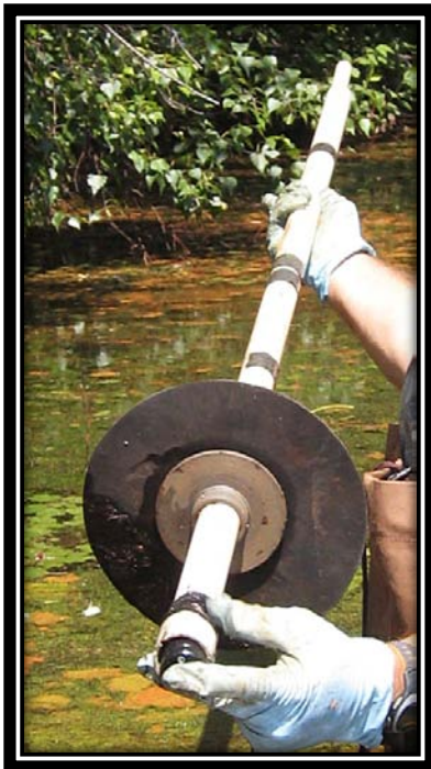
A plunger used to place temperature buttons at different depths in sediment.