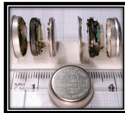
Examples of type of buttons used to log temperatures. Foreground: intact button, showing size. Background: opened to show the computer chips enclosed in durable weather resistant stainless steel.

MORE LAND RESEARCH ON THE WEB: www.epa.gov/nrmrl/lrpcd