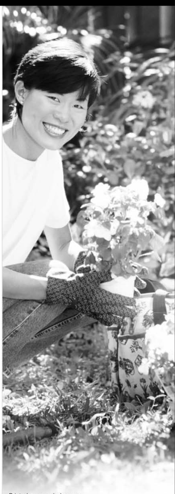
Printed on recycled paper.