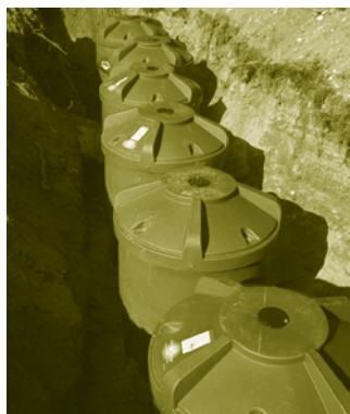
Above, top: The SmartStorm Rainwater Recovery System, developed by the Charles River Watershed Association; the cisterns and pumps can be easily hidden by landscape plantings.