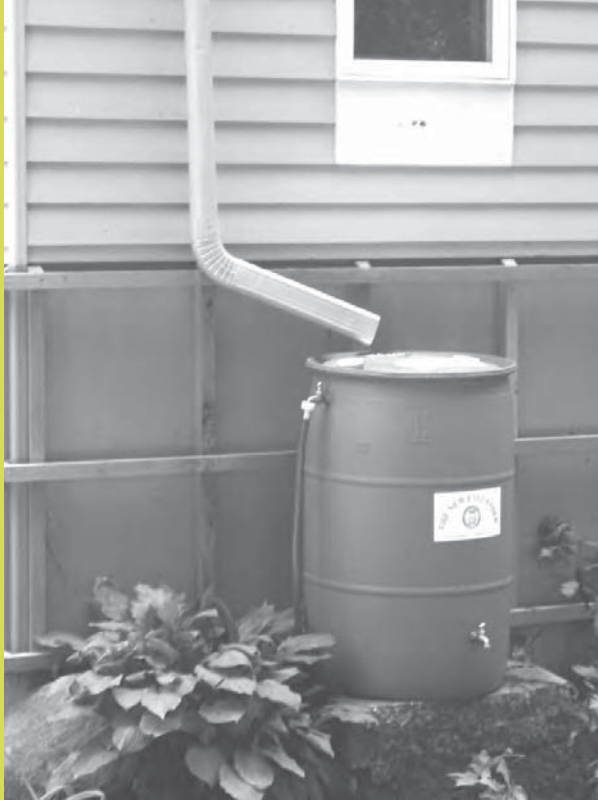
The overflow outlet from this rain barrel drains into an adjacent rain garden.

stormwater management system, but can provide cost savings because they reduce the demand for potable water for landscaping and irrigation. The cost-benefit ratio will depend on how much landscaping/irrigation water the property owner uses, and the unit cost of water from the local public water supply.