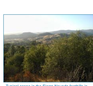
Mariposa County, California, U.S.A.

The Sierra Nevada foothills ecoregion in California is an ideal study system due to the variety of plant species and the presence of habitats ranging from pristine to highly fragmented.