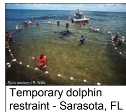
Temporary dolphin restraint - Sarasota, FL

Bottlenose dolphins utilize their appendages (dorsal fin, pectoral flippers, flukes) as thermal windows to either dissipate or conserve heat. In contrast, the body wall, insulated by blubber, is a relatively static thermal surface. To quantify heat loss across these surfaces, heat flux (HF), skin surface temperature ( T_s ), and \Delta T (equals T_s - T_{water} ) were measured simultaneously at 6 body sites (see below). Blubber thickness across the body wall was also measured. These measurements were collected during health monitoring events for wild bottlenose dolphins resident to Sarasota Bay, FL (NOAA Permit No. 522-1569).