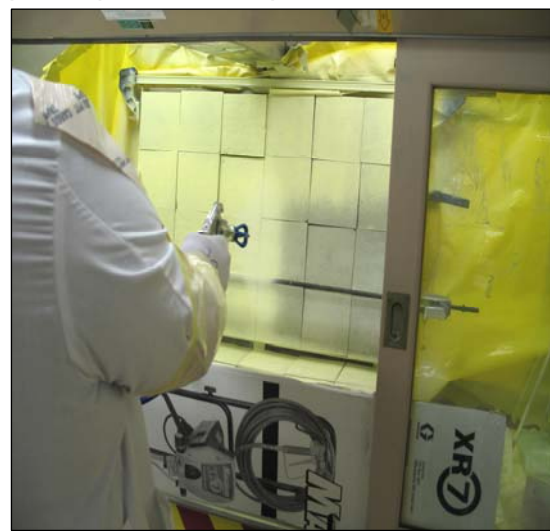
Figure 1. Applying the Coating With a Sprayer

The technologies were evaluated for decontamination efficacy; labor costs and requirements; ease of use on irregular surfaces; surface damage; application and removal times; portability and secondary waste generation; utility requirements; and preparation and cleanup effort.