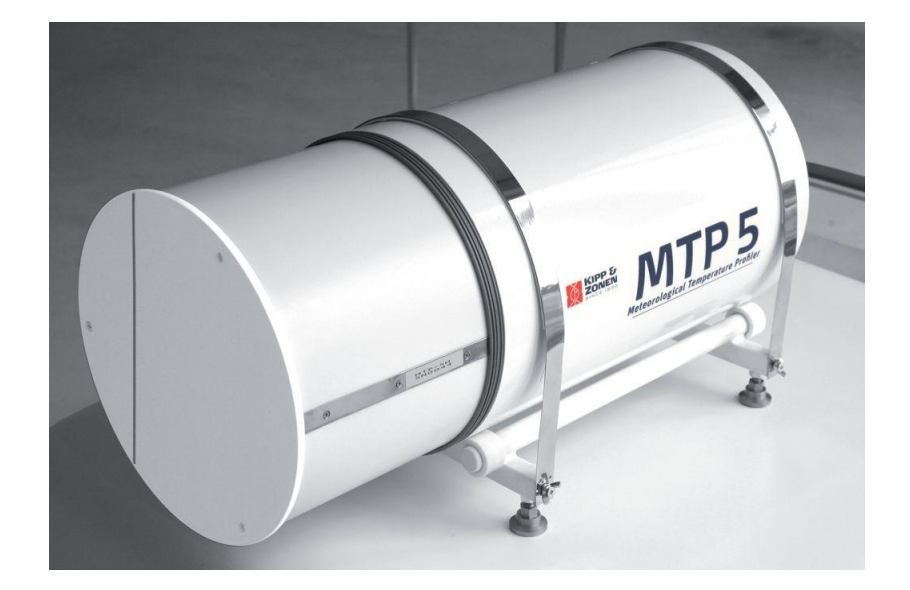
Figure 1-1. Example single channel commercially available profiling radiometer for measuring temperature profiles (photo courtesy of Kipp and Zonen).