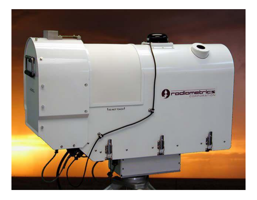
Figure 1-2. Example multi-channel commercially available profiling radiometer for measuring temperature, humidity and liquid water content.

Figure 1-1. Example single channel commercially available profiling radiometer for measuring temperature profiles.