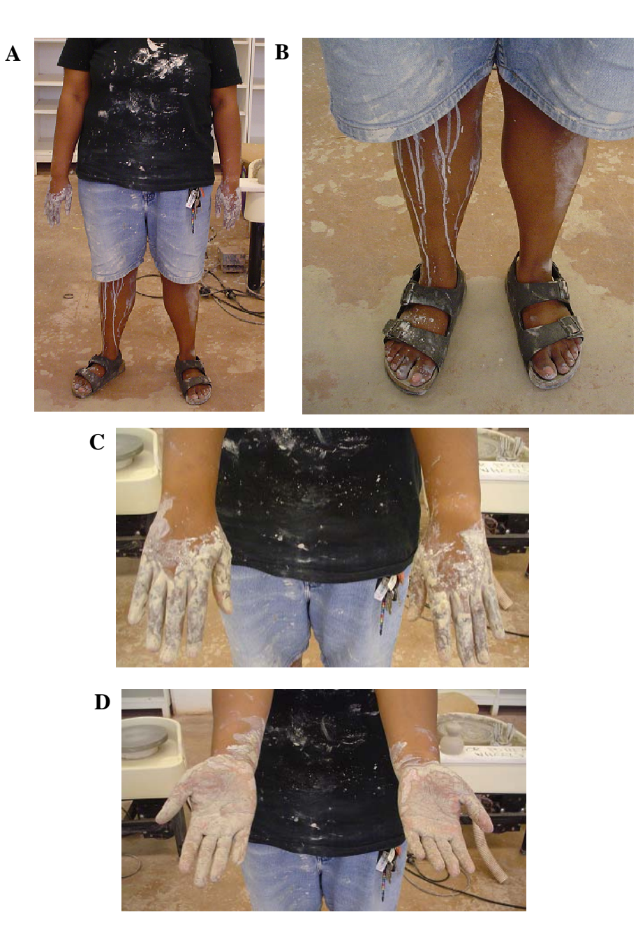
Figure B-3. Subject 9.