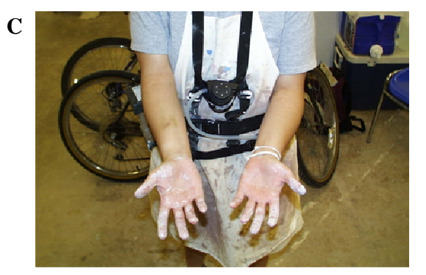
Figure B-2. Subjects 5–8.

This document is a draft for review purposes only and does not constitute Agency policy. B-3 DRAFT—DO NOT CITE OR QUOTE