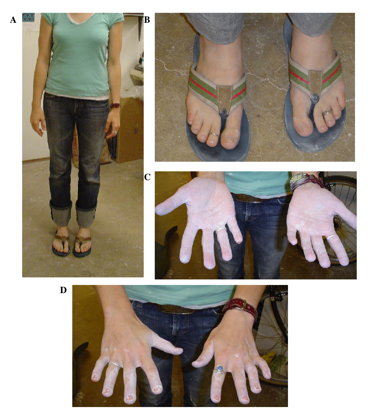
Figure B-4. Subject 10.