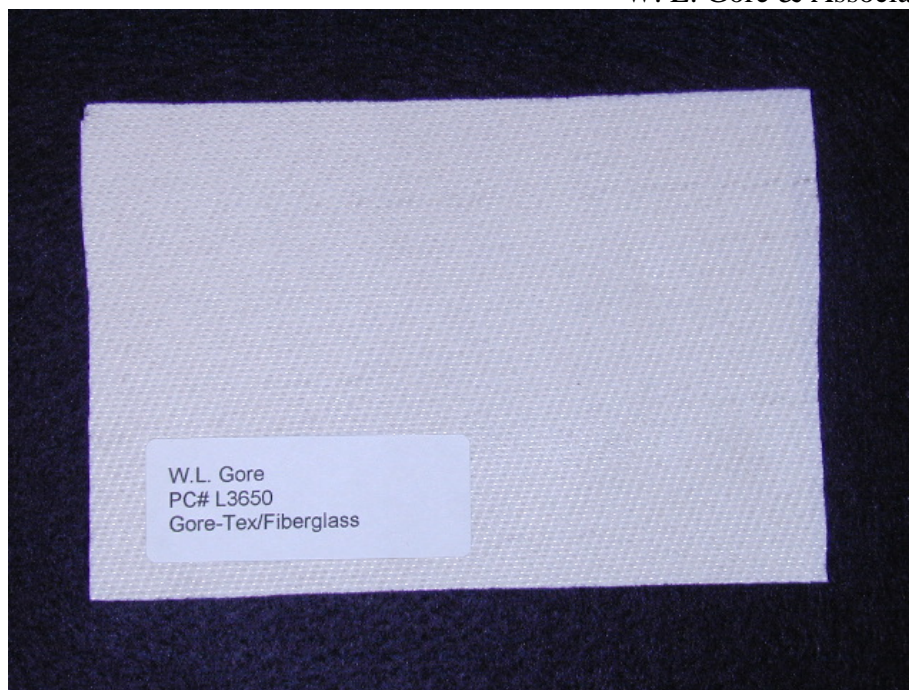
Figure 1. Photograph of W. L. Gore & Associates, Inc.'s L3650 filter fabric