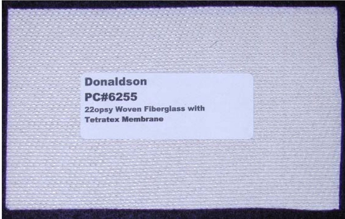
Figure 1. Photograph of Donaldson Company, Inc.'s 6255 Filtration Media