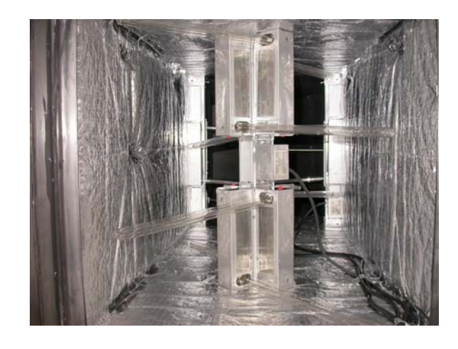
Figure 2-2. Alternate view of device installed inside the test rig. Front unit, 2 back units, and reflective material shown.

For more information on the Altru-V V-Flex, contact: