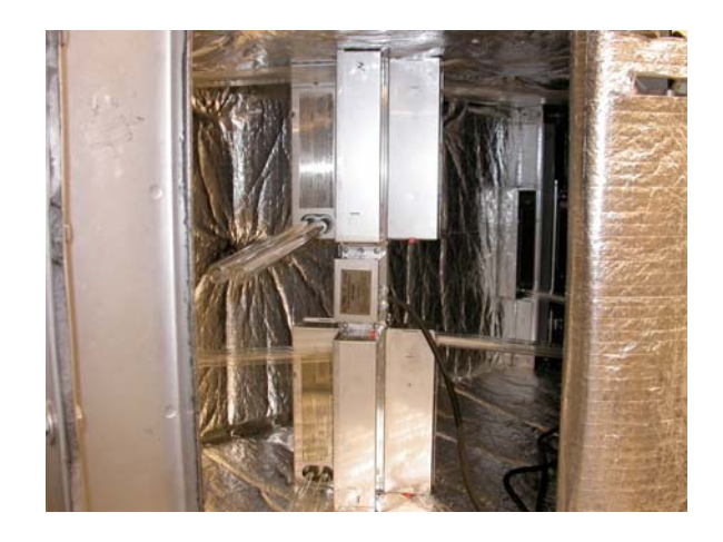
Figure 2-1. Device installed inside the test rig. Front unit shown through door of test rig.