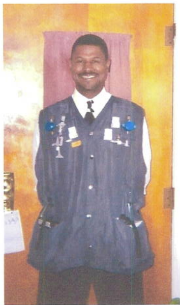
A) Personal exposure vest