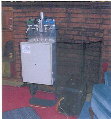
B) Indoor sampling platform