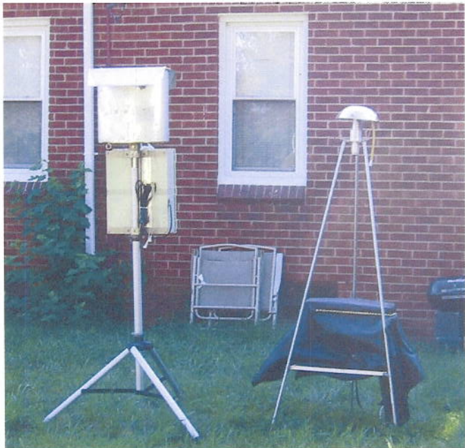
C) Outdoor sampling platform