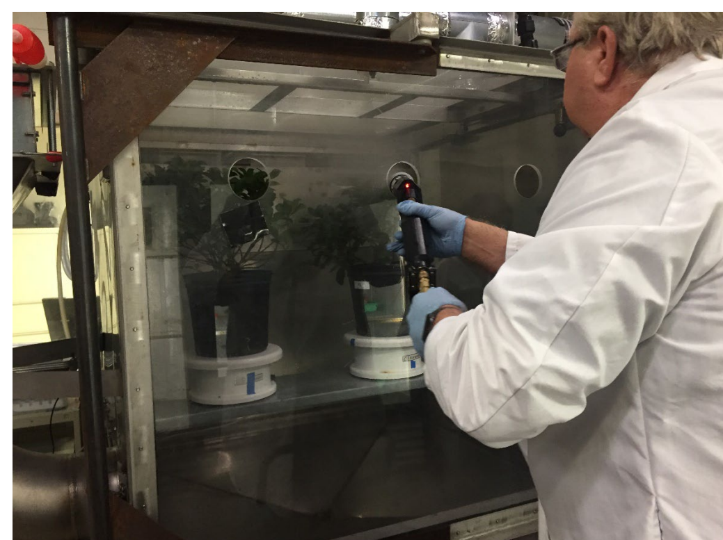
Both electrostatic sprayers and back pack sprayers used in testing