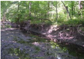
Figure 2. Mineral flat wetland in East Hanover, NJ.

Wetlands are known for their ability to remove nitrate due to their saturated soils. They are used as a management tool to remove nitrate before it becomes a pollution problem in streams. Are wetlands in urban landscapes (figure 1) still performing this service?