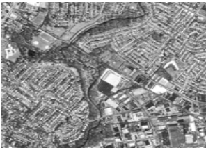
Figure 1. Riverine wetland near Newark, NJ.