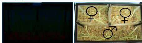
Figure 2: (A) Frontal view of mate choice tanks, (B) Top view of mate choice tanks