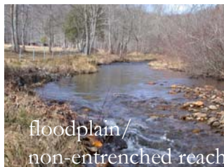
floodplain/ non-entrenched reach

In order for restoration activities to be successful, managers need a good understanding of the dynamics inherent in a particular system. Entrenchment is a morphological condition which results from disequilibrium in aquatic systems due to the disconnection of a channel and its adjacent floodplain. In the Southeast, this is most typically due to land use practices that eroded historic sediment from the hillslopes and caused the channel to aggrade. As the stream incised through this deposited sediment, it became entrenched. These types of streams, although the focus for widespread restoration efforts, have not been quantitatively studied. This study focuses on the dynamics of entrenched stream reaches and how they respond during baseflow and flood conditions in relation to channel morphology, streambed composition, and sediment transport.